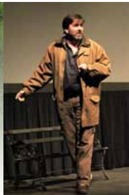
Harry Edison performs My Brother's Keeper - covered a lot of deep, moving ground