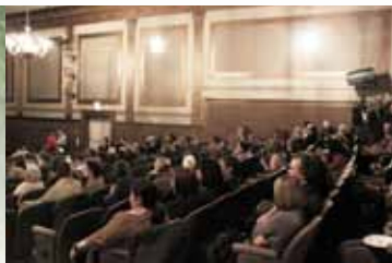
Crowd of 300 watch the performance and Live Auction