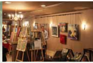
Great art displayed by Strand Fine Art Services in the art deco Palace Theatre